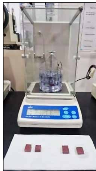
Figure 3. Analytic balance DSL910.

To perform this test, the preparation of specimens with similar dimensions was carried out. Then, a determined volume of anhydrous