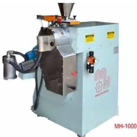
Figure 1. Thermokinetic mixer (DRAISS homogenizer).