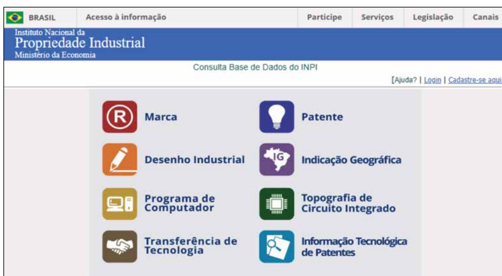
Figure 2. INPI database interface.