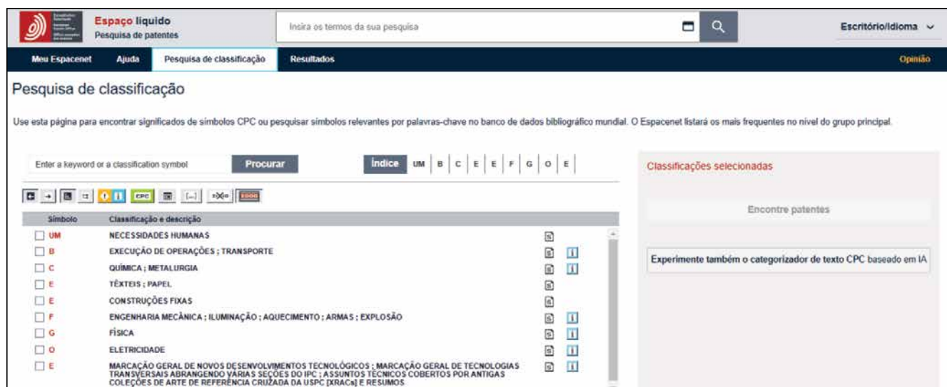
Figure 4. Interface of the ESPACENET database.

Google Patents integrates information from various databases and features a simplified interface, making it more accessible for less experienced users. Lens stands out by combining patent data with academic information, making it especially useful for research involving scientific innovation. On the other hand, Derwent Innovation