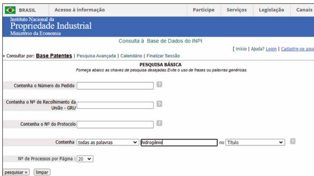
Figure 3. INPI database.

Source: Instituto Nacional de Propriedade Industrial (INPI) [3].