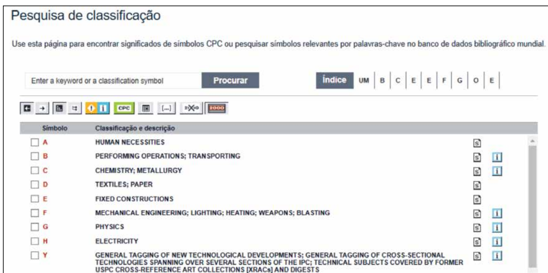
Figure 5. Classification-based search in the ESPACENET database.